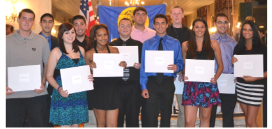
2011 SCHOLARSHIP WINNERS