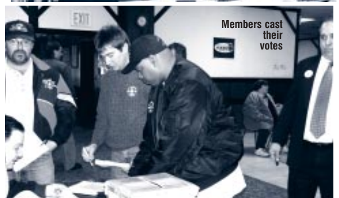
Members cast their votes